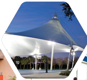
IOTA RESIDENCE COMPLEX (2006, LEED-certified)