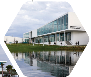
THE HELMAR AND ENOLE NIELSEN CENTER FOR VISUAL ARTS (2018)