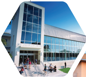
ARMACOST LIBRARY (2005)